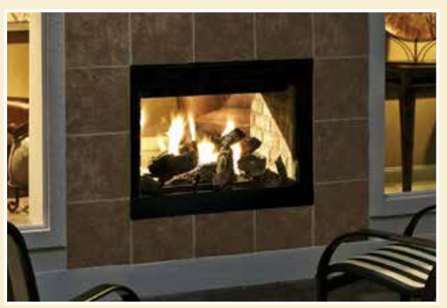
Above: Twilight II (outdoor side) shown with standard exterior front

Multiple combinations of interior fronts and finishes complement your décor