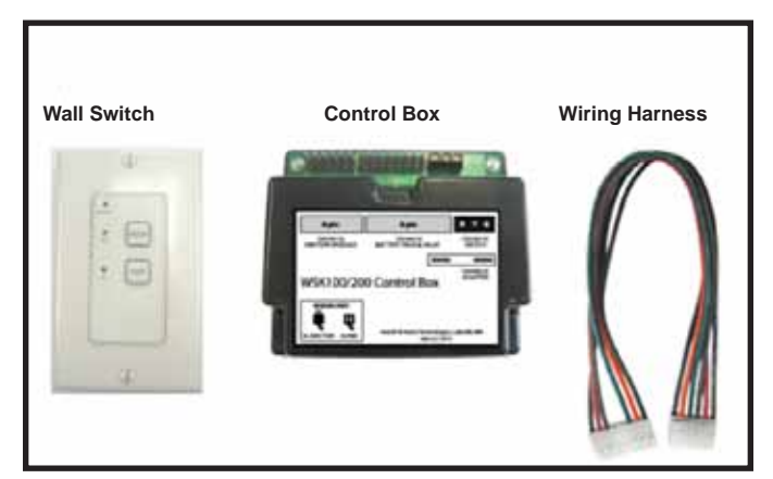
Figure 1. Items included in the WSK100 Wall Switch Kit