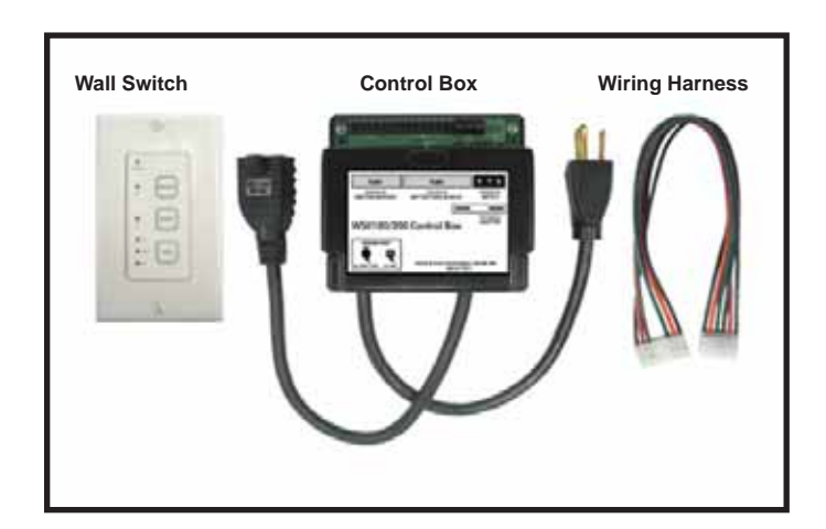
Figure 2. Items included in the WSK200 and WSK210 Wall Switch Kit. (Delay circuit not shown).

Printed in U.S.A. Copyright 2007 Hearth & Home Technologies Inc. 20802 Kensington Boulevard, Lakeville, MN 55044