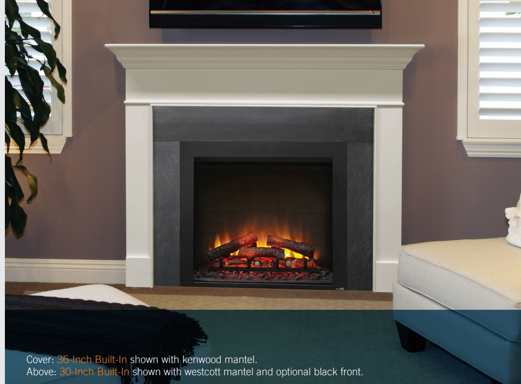
Cover: 36-Inch Built-In shown with kenwood mantel. Above: 30-Inch Built-In shown with westcott mantel and optional black front.